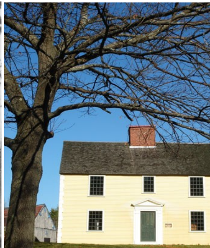
Francis Wyman House Current Photo