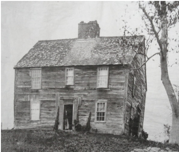
Francis Wyman House about 1900