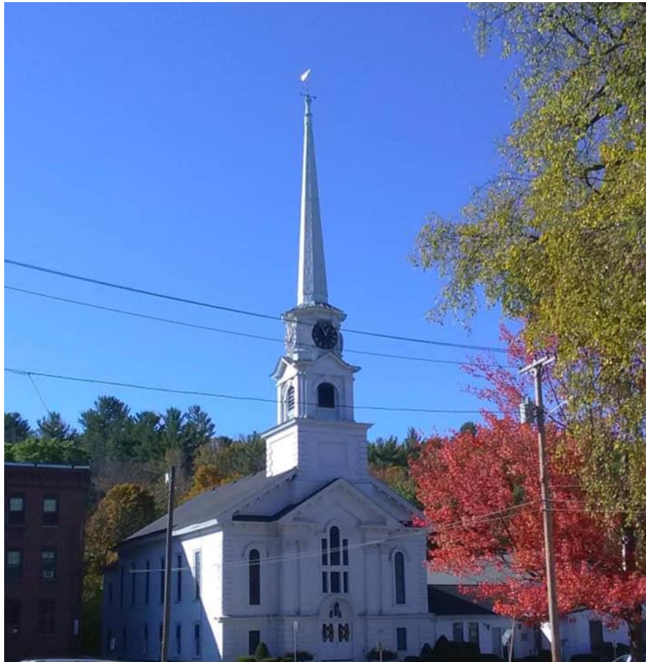
Athol, MA Congregational Church, Dedicated December 3, 1828