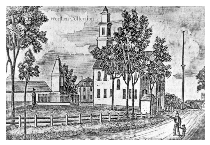
Revolutionary Monument and Meeting-house, 1837

According to an account of the visit written by Lafayette's secretary, Auguste Levasseur, two of the survivors "related to us this first scene of the grand revolutionary tragedy, in which they were actors." They "named with tenderness those of their companions and friends who fell by their sides, turning their eyes filled with tears upon the ground ... After some moments of solemn silence, one of the two old men exclaimed, 'we still weep for our brethren, but we do not deplore them, they died for their country and liberty!"