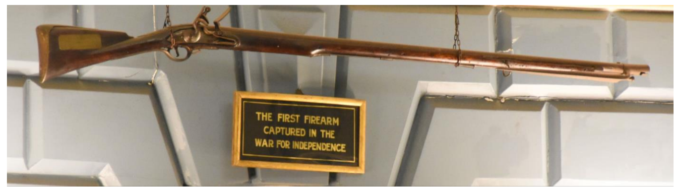
THE FIRST FIREARM CAPTURED IN THE WAR OF INDEPENDENCE

That musket was passed down in the possession of the Parker family until the captain's grandson, Theodore Parker, willed it to the State of Massachusetts and it is now on display in the Senate Chamber of the Massachusetts State Capital next to the musket carried by Captain Parker on April 19, 1775.<sup>23</sup>