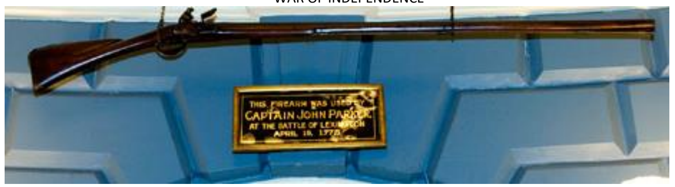
THIS FIREARM WAS USED BY CAPTAIN JOHN PARKER AT THE BATTLE OF LEXINGTON APRIL 19, 1775